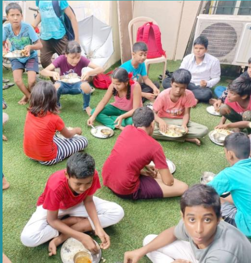
March 4 th