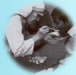
March 13 th